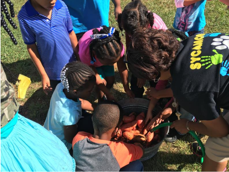
Figure 4 WOW! What a Whopper as students gather their sweet potato crop!