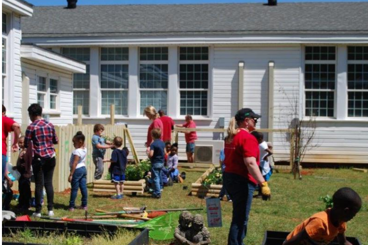
Figure 1 and 2 below: Alabama Power Partners (in red T-shirts) work with students, parents and staff to build gardens and PLANT!

10. Submit 5 of photos (with appropriate permissions) or up to 5 minutes of video content.