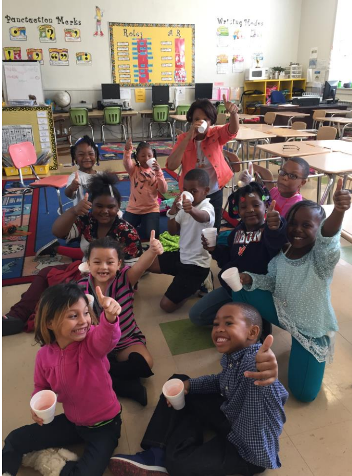
Figure 3 Thumbs Up for a great fresh fruit and vegetable smoothie on Club Day for the Chef's Club