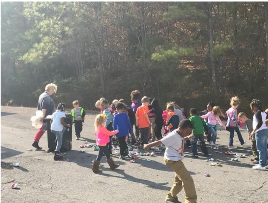
Figure 5 Kindergarten Stomps Out Litter by Collecting and Stomping Cans for Recycling