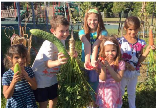
Figure 8 AIS students harvest vegetables in the summer.

nutrients to sustain plant life. They grow their own flowers for school graduation, and then continue the lifecycle of the plants by taking them home and transitioning them into soil.