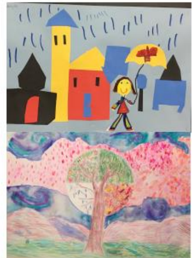
Figure 5 Examples of AIS student artwork inspired by the environment and science lessons.