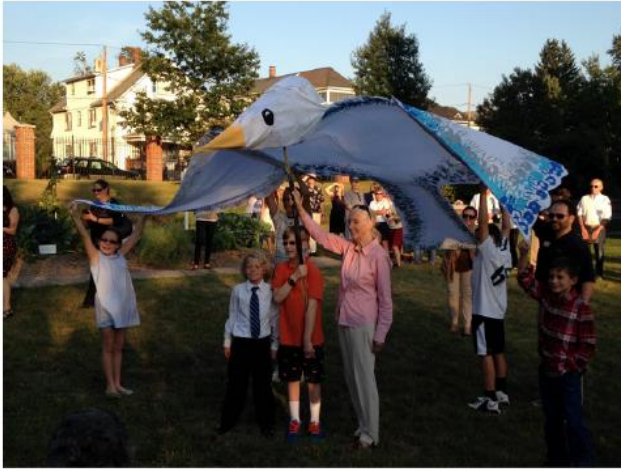
Figure 3 Jane Goodall from Roots and Shoots joins AIS students to fly their giant peace dove.