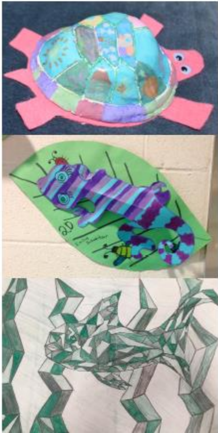
Figure 6 AIS student animal art projects.

AIS 3rd grade students learn about linear and radial symmetry and identify these concepts as they occur in nature. They create a design of 2-D and 3-D shapes and folded paper forms, utilizing the mathematical and scientific concepts they have reviewed, including fractions and symmetry. Similarly, 4th grade students create self-portraits using their knowledge of fractions, proportions, and linear symmetry and explore how and where these concepts occur naturally in the world.