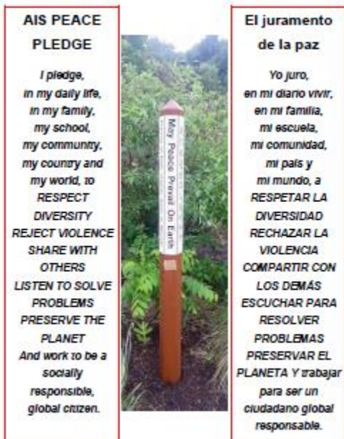
Figure 2 AIS Peace Pledge in English and Spanish.

AIS’s school philosophy encourages students to look outside themselves and be part of a larger community. Students develop skills in communication, conflict resolution, and social advocacy via effective modeling practices throughout their school day as well as instruction during community time. Furthermore, AIS’s International Studies theme is centered on the concept of peace and our role as peacekeepers in the world. Hence, the AIS community starts each day reciting the school’s Peace Pledge in English and in Spanish. (Figure 2)