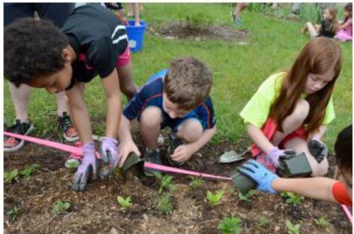
Figure 7 AIS students help to plant spring plants in the garden.

nutrients to sustain plant life. They grow their own flowers for school graduation, and then continue the lifecycle of the plants by taking them home and transitioning them into soil.